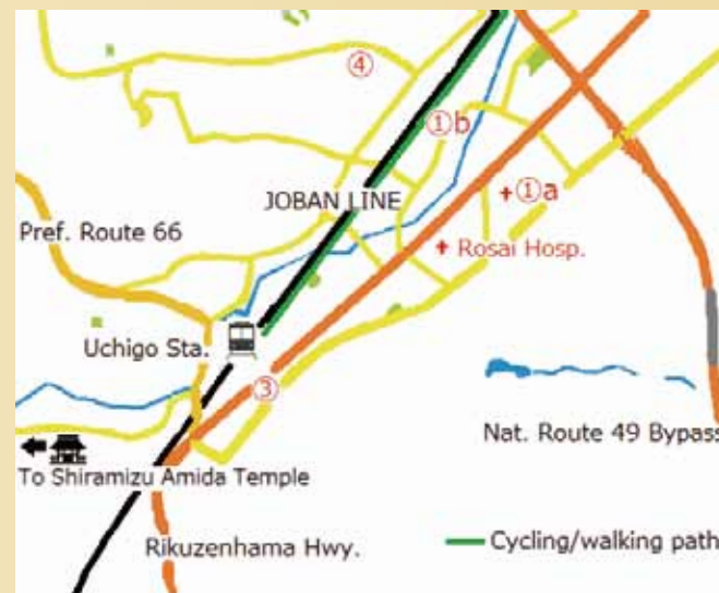
Uchigo Station Area

As the central station for Iwaki, there are many things to see and do around Iwaki Station (so many that we can't include them all in this article!). The area has a long history as the site of the former Iwakitaira Castle and you can get a taste of Iwaki's history by visiting the surrounding parks and walking down each street.