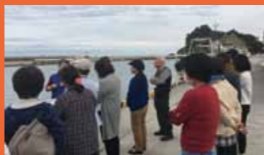
The study tour participants listening to a local guide at Hisanohama Fishing Port

For one of the recent study tours on 13 October, volunteers from the Iwaki International Association (IIA) provided English interpreting for a number of foreign residents of Iwaki who took part in the tour. The participants visited facilities such as Reprun Fukushima, where visitors are informed about the interim storage of soil removed from decontamination works, the recently reopened J-Village sports training facility, and Hisanohama, the northernmost district of Iwaki that was briefly evacuated in the first few months after the nuclear disaster.