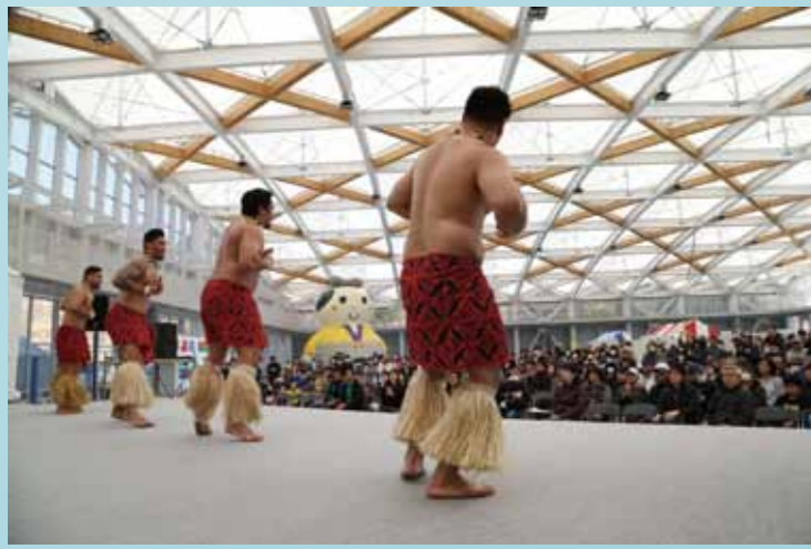
To celebrate Iwaki hosting its second consecutive PALM Summit, Iwaki Vision will introduce the 14 Pacific Island nations that will participate in the summit over the next two issues.

The event turned out to be a huge success with thousands of people getting involved in the activities or watching the Pacific dances. Now Iwaki and the rest of Fukushima is eagerly awaiting the second consecutive PALM8 Summit in Iwaki.