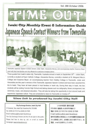
Front page of Time Out vol. 188 October 2006 (10 years ago)